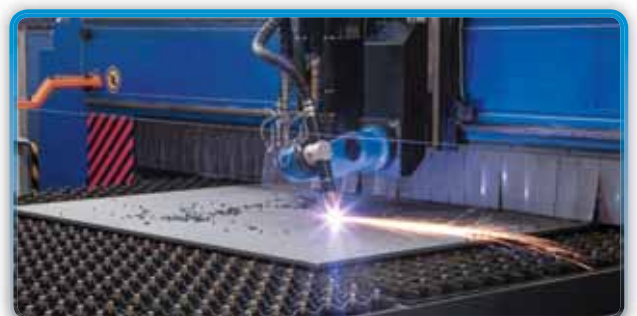
④ Plasma and Oxy Units