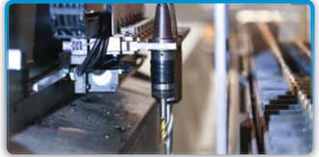
② 8-Station Tool Changer