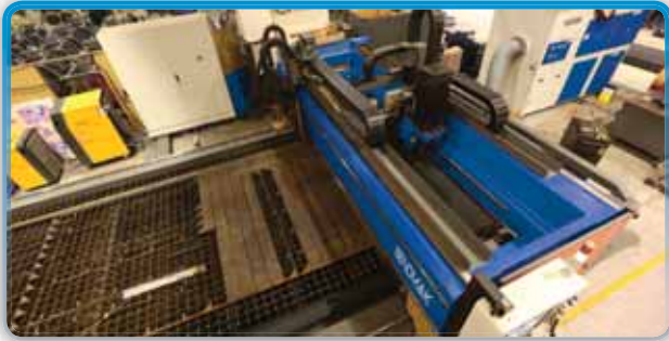
① Moving bridge