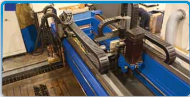
③ Drill Unit